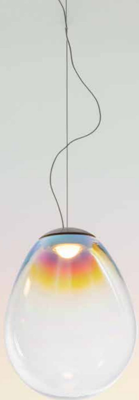
Stellar Nebula 22