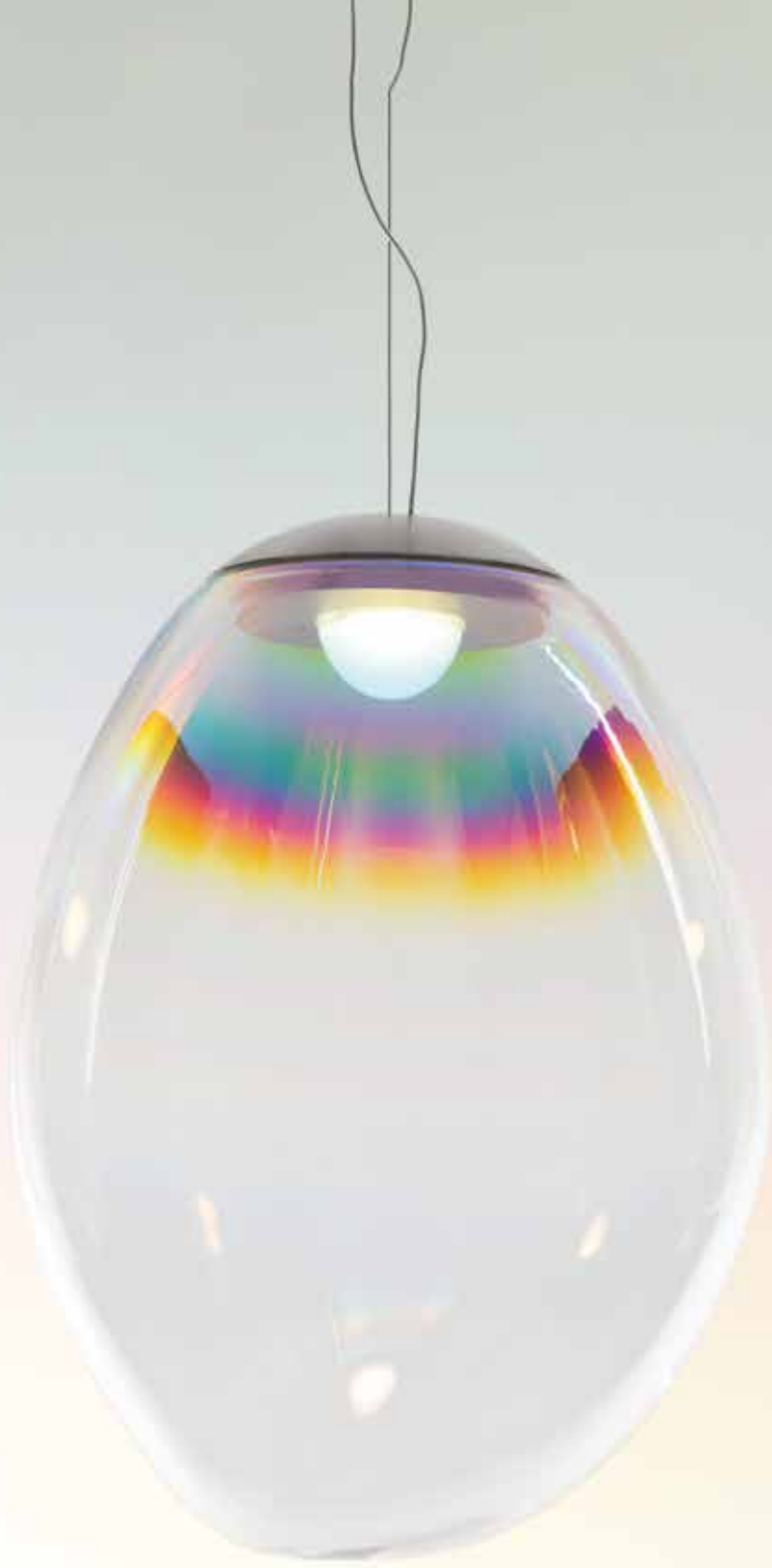
Stellar Nebula 40