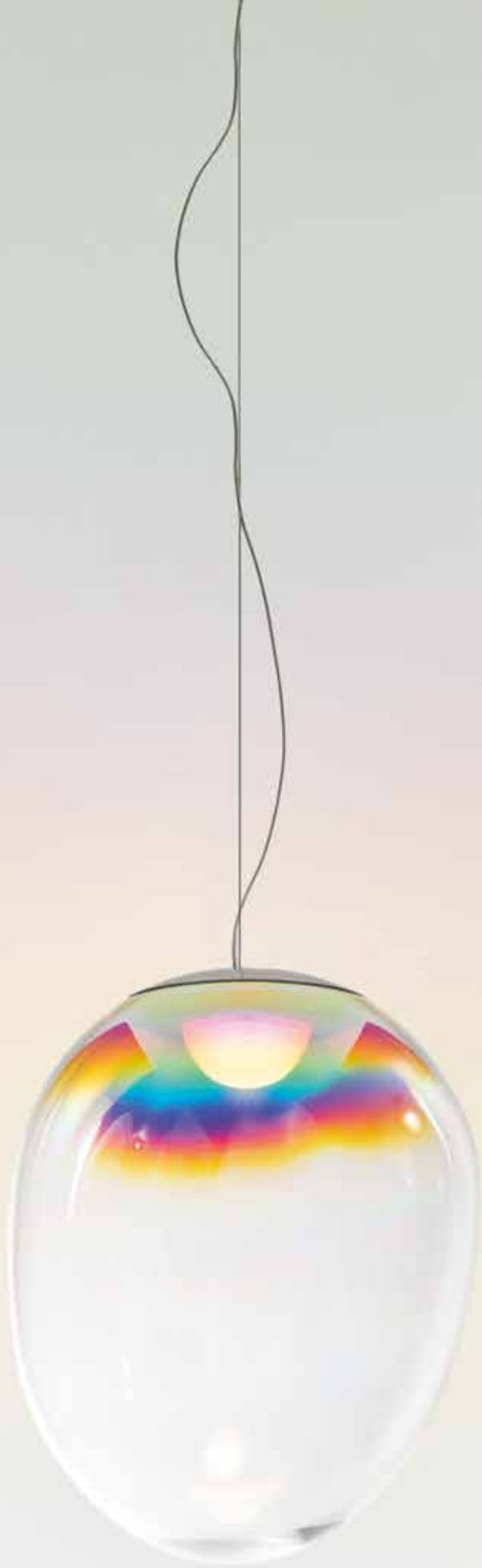
Stellar Nebula 30